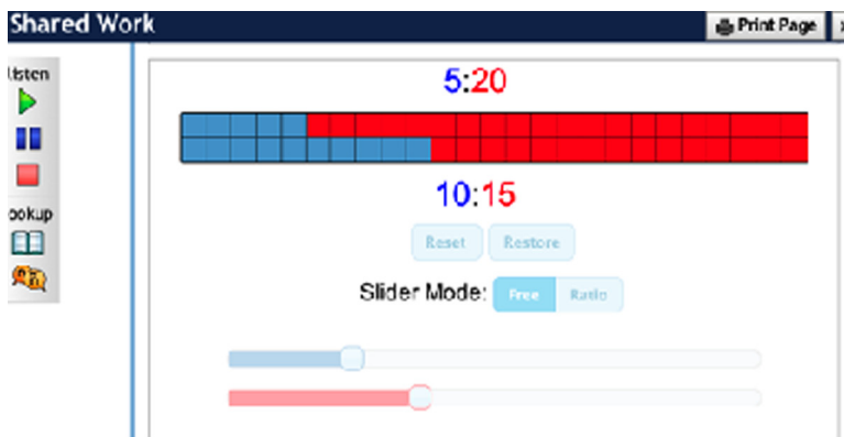
Figure 3. Ratio bar visualizer in the dynabook shared space

something different. Has to change their concept of relationships.